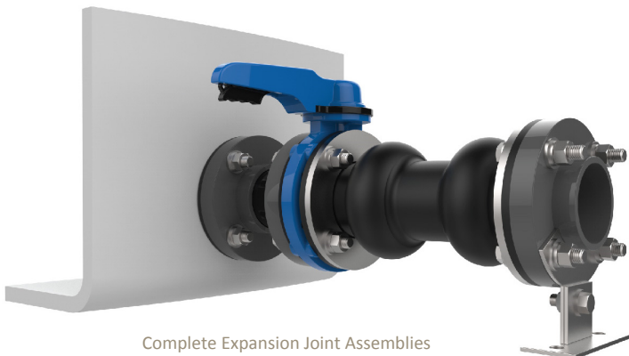
Complete Expansion Joint Assemblies