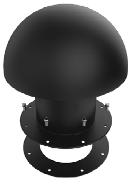
Standalone and Insert Style 8" Mushroom Vents

Until now, the functional capabilities of polyethylene tanks have been limited due to a relatively small selection of commercially available fittings and accessories. Today, CRP Tank Specialties, Inc. brings to market a wide range of high performance 6" - 24" tank adapters, side manways, vents, ladders, scrubbers and creative solutions to meet your unique challenges. Our fiberglass fittings and manways have been granted U.S. Patent no. 9,464,745.