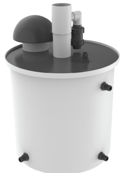
VentMaster Fume Scrubber